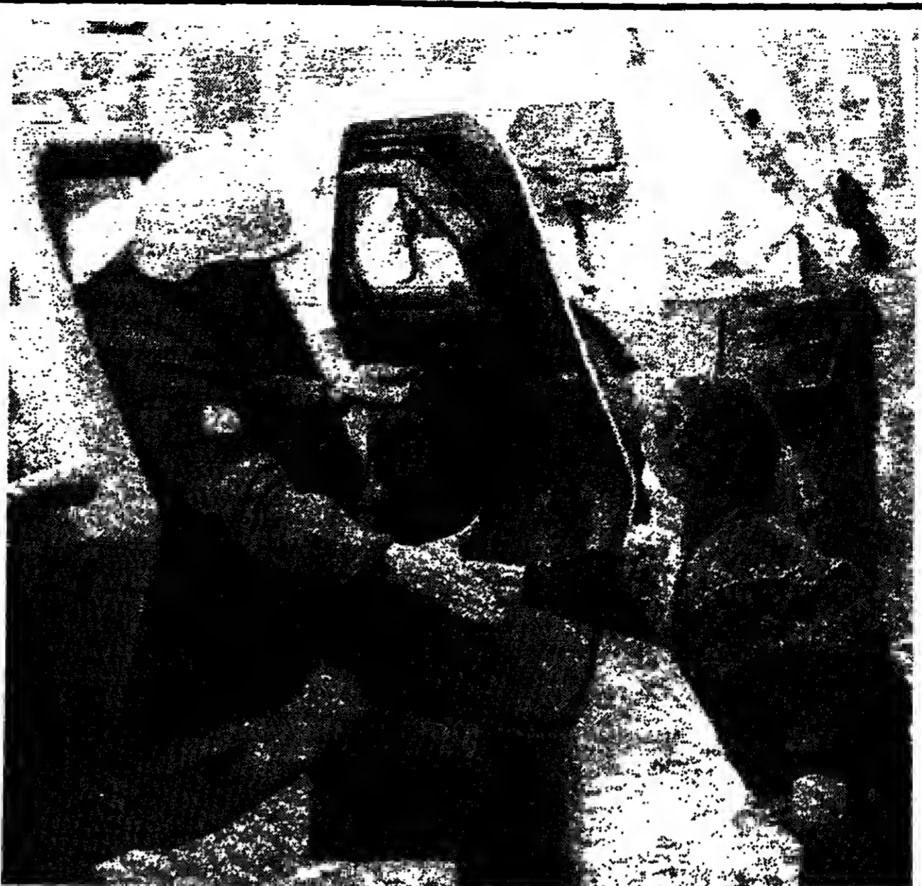
A UN soldier with a child Sunday in Sarajevo. The UN chief said the body's members may need to send troops to Bosnia. Page 4.